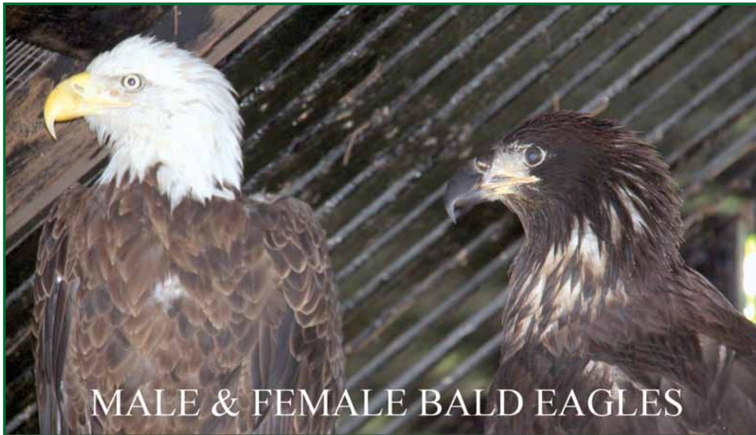
MALE & FEMALE BALD EAGLES

The MALE BALD EAGLE is still in good health and flies the length of the enclosure easily, but he does favor one wing. So, we have decided after talking to one of our vets, to extend his stay for further rehabilitation. We have contacted The Wildlife Center of VA, where they have specialists to work with bald eagles. We wanted to see if they would be able to work with him for further therapy. If they are interested in working with him, he can receive therapy to strengthen the wing that was gunshot. Nothing has been decided about moving him yet. Whether he stays or is moved, he cannot be released until his wing recovers completely. Even though we really would like to see him all the way through to complete his rehabilitation, we will do whatever is necessary for his best chances of recovery and release.