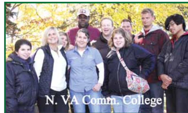
N. VA Comm. College